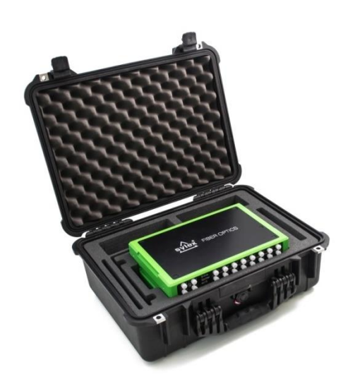
Figure 2: Waterproof, crash proof and dust proof transportation case as optional packaging

For more information contact our sales team at sales@sylex.sk