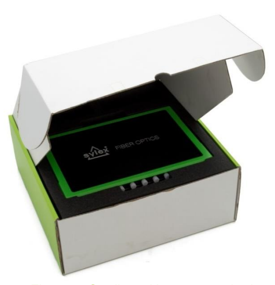
Figure 1: Cardboard box as standard packaging